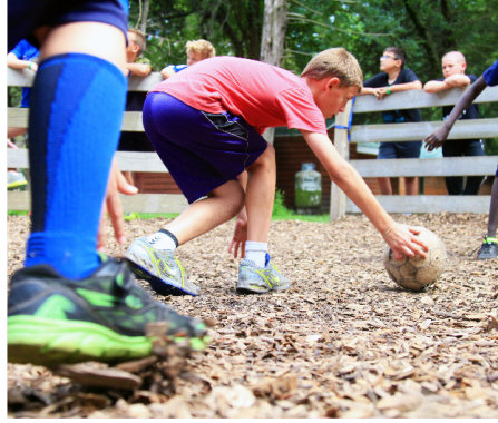
Above: Explorer campers compete against each other in gaga.

"For everyone who has been born of God overcomes the world. And this is the victory that has overcome the world—our faith. Who is it that overcomes the world except the one who believes that Jesus is the Son of God?" 1 John 5:4-5