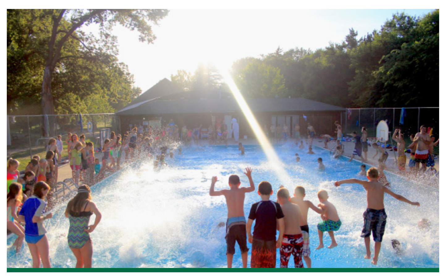
Above: Explorer campers and counselors begin jumping into the pool during their morning polar bear swim.