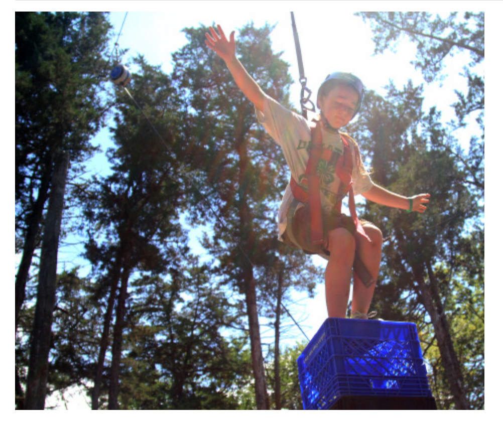
Top left: Explorer camper balances on crate stacking during free time at the tower.

Top right: Senior high campers prepare for WAVE Games at the lake.