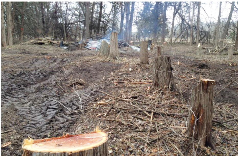
This is the site of the future Summer Staff Housing/Discipleship Program building.

The area for the new facility addition is being cleared just south of the chapel and we hope to begin construction before this summer. This project is key for the start of the Discipleship Program slated to begin at Covenant Cedars in September of 2016. This new building will not only house the camp's Summer Staff but will also house up to