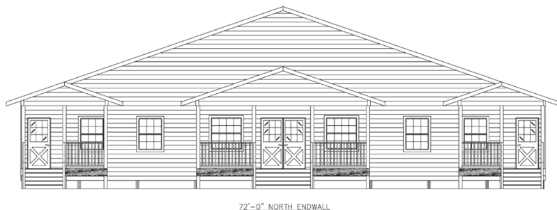
72'-0" NORTH ENDWALL