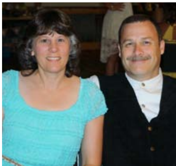
For a complete bio visit our website: www.cedars.org